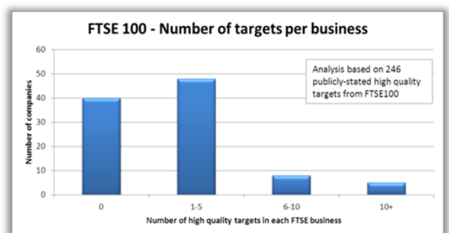
Figure 1 FTSE 100 – Number of targets per business